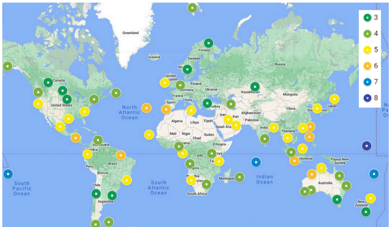
Figure 2: J-Star Height Accuracy in cm

J-Star is a subscription service, and included in selected JAVAD products for 1 year. Subscriptions apply after the first year. Contact sales@javad.com or your local dealer for J-Star capable receivers.